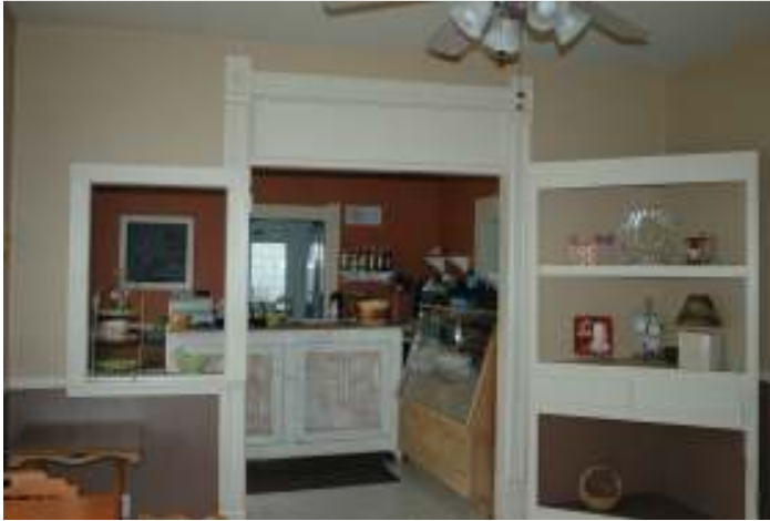
Check out area with plenty of display area and casework