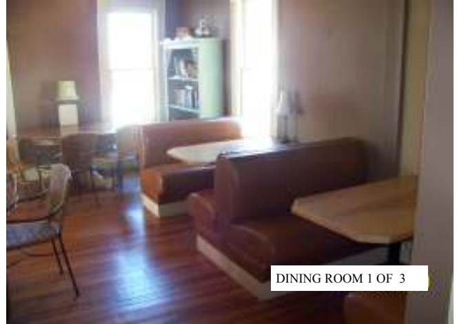
DINING ROOM 1 OF 3