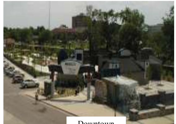
Downtown Elkhart District